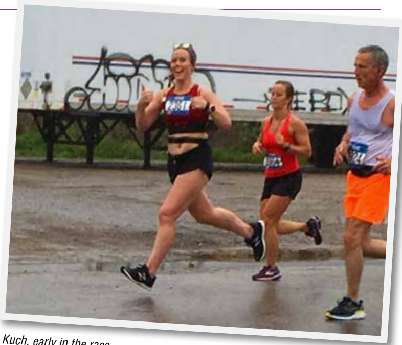
Kuch, early in the race.

Miles 7-9 - 7:59, 8:06, 8:07 - Still had heavy-feeling legs from the hill and tried to shake it off. I was still on pace but it was feeling more difficult. Overall, I just felt kind of odd. Once I hit 9.5 I was at about an 8:25 and it felt way too hard. That's my go-forever pace, and I knew something was wrong.